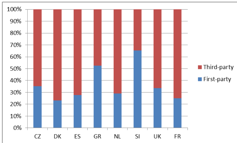
Figure 1: The ratio of first and third party cookies set by sites according to the country participating in the sweep